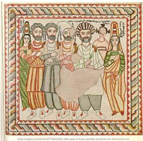
1st Century Christian Mosaic at Edessa

Our Lord replies to the king through the emissary whom Abgar had sent to Jerusalem to meet with Jesus by the name of Hannan (Annas):