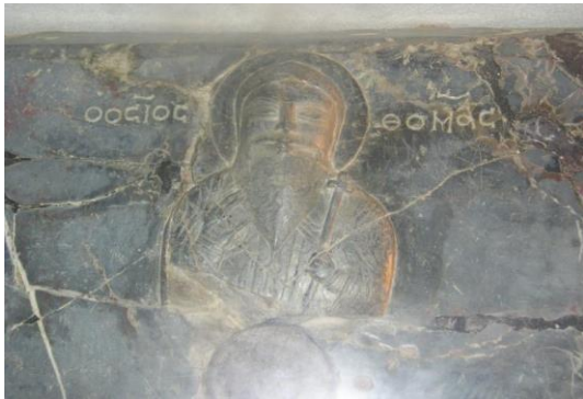
Reliquary of St. Thomas at Ortona