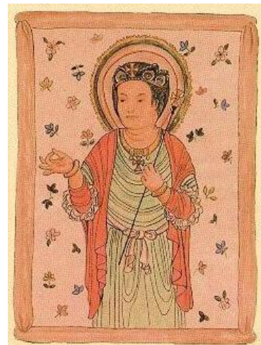
A Mongolian Bishop of the Church of the East

The Church enjoyed alternate periods of rest and persecution after the move of the caliphate to Baghdad from Damascus in 752 AD. In around 780, the seat of the patriarch moved to Baghdad, the new capital of the Islamic empire, from Seleucia-Ctesiphon. The monks and clergy of the Assyrian Church served the royal court in the capacities of the court physicians and scribes. Many of the Greek works of philosophy were translated into Arabic by these Nestorian scholars; these works later were translated into Latin and found