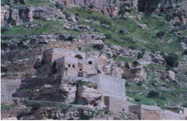
7 th cen. Assyrian monastery of St. Hurmizd at Alqosh

However, Christianity already flourished among the Assyrians of northern