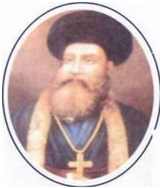
1 st Uniate Chaldean Patriarch John Sulaqa

venerated in this Church. In the Hakkari region of southeastern Turkey were to be found centuries-old churches, and it was here that the Christian Assyrians—for many others of them adopted other religions—found refuge.