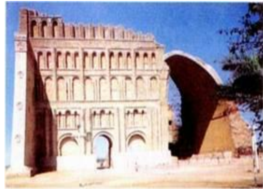
Remains of the Persian Palace at Seleucia

The other major missionary activity took place by the end of the first Christian century centered around the royal twin-cities of Seleucia-Ctesiphon. The city was founded by one of the generals of Alexander the Great, Seleucus I Nicator in the fourth century BC. Later, it became the winter residence of the Persian emperors sometime after 129 BC. According to the document, the Acts of Mari , St. Thaddeus (Addai) had sent his disciple Mari from Edessa to preach to the inhabitants of the royal cities.