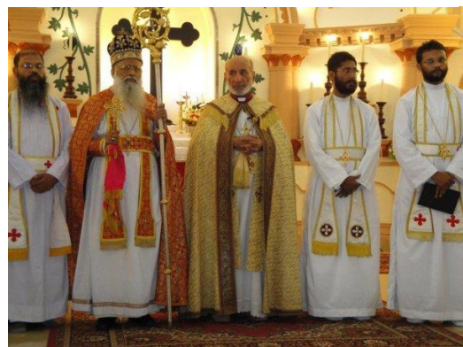
The Metropolitan of India with the New Bishops, January 2010