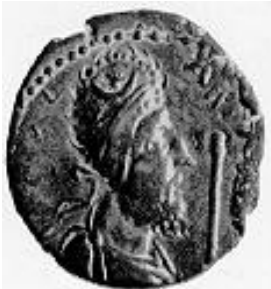
Edessene Coin of Abgar

Missionaries from the Holy City of Jerusalem came to preach the Gospel among the Jews in the Diaspora present in Mesopotamia and the Persian Empire. The Acts of the Apostles only records the first Christian missions within the limits of the Roman Empire. Therefore, it is the holy tradition of the Assyrian Church, couples with historical evidences, that records the spread of the Gospel outside of the limits of the Roman Empire, namely within the Persian Empire—the second superpower of its day.